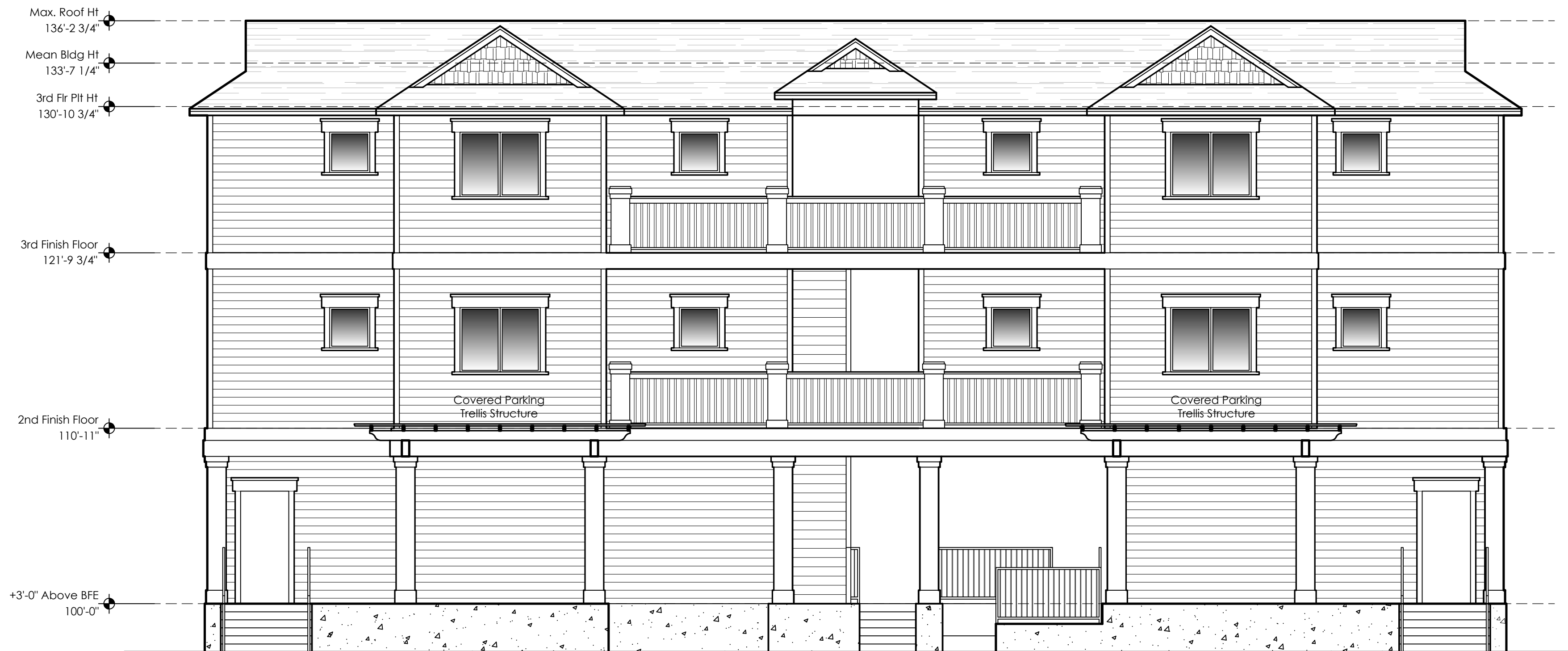
3 | West Exterior Elevation