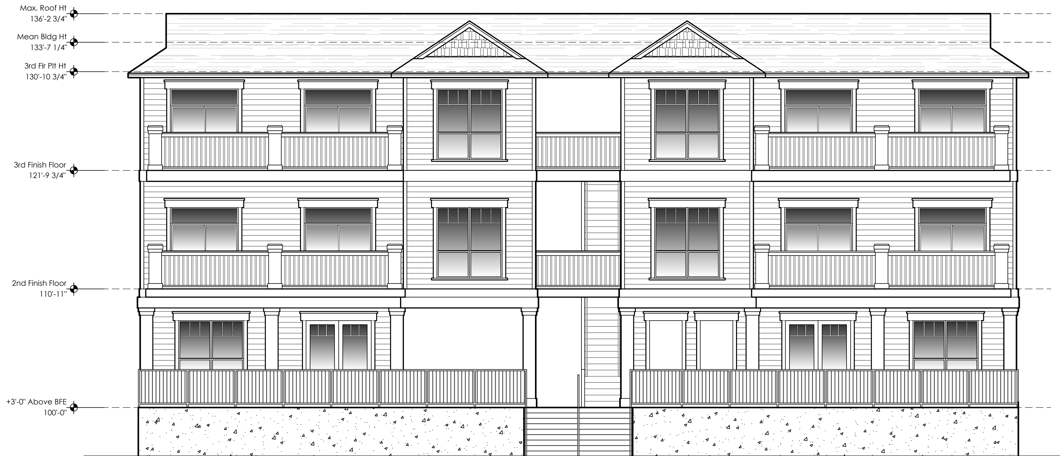
1 | East Exterior Elevation